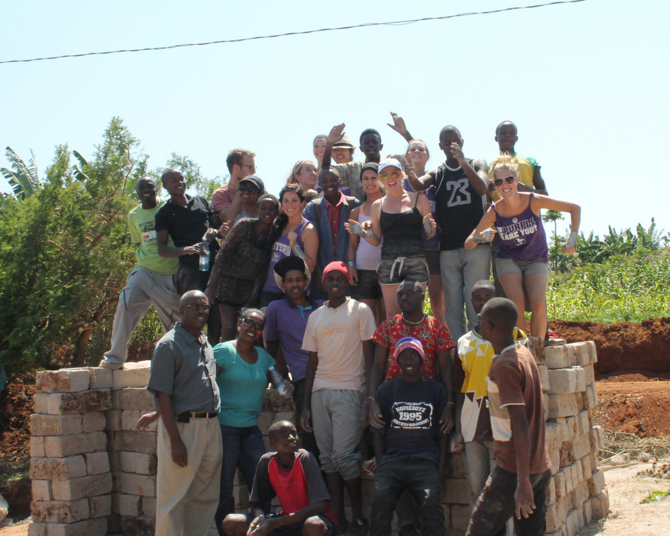
2013 team helping prepare the ground for Centre Marembo's newly built clinic.