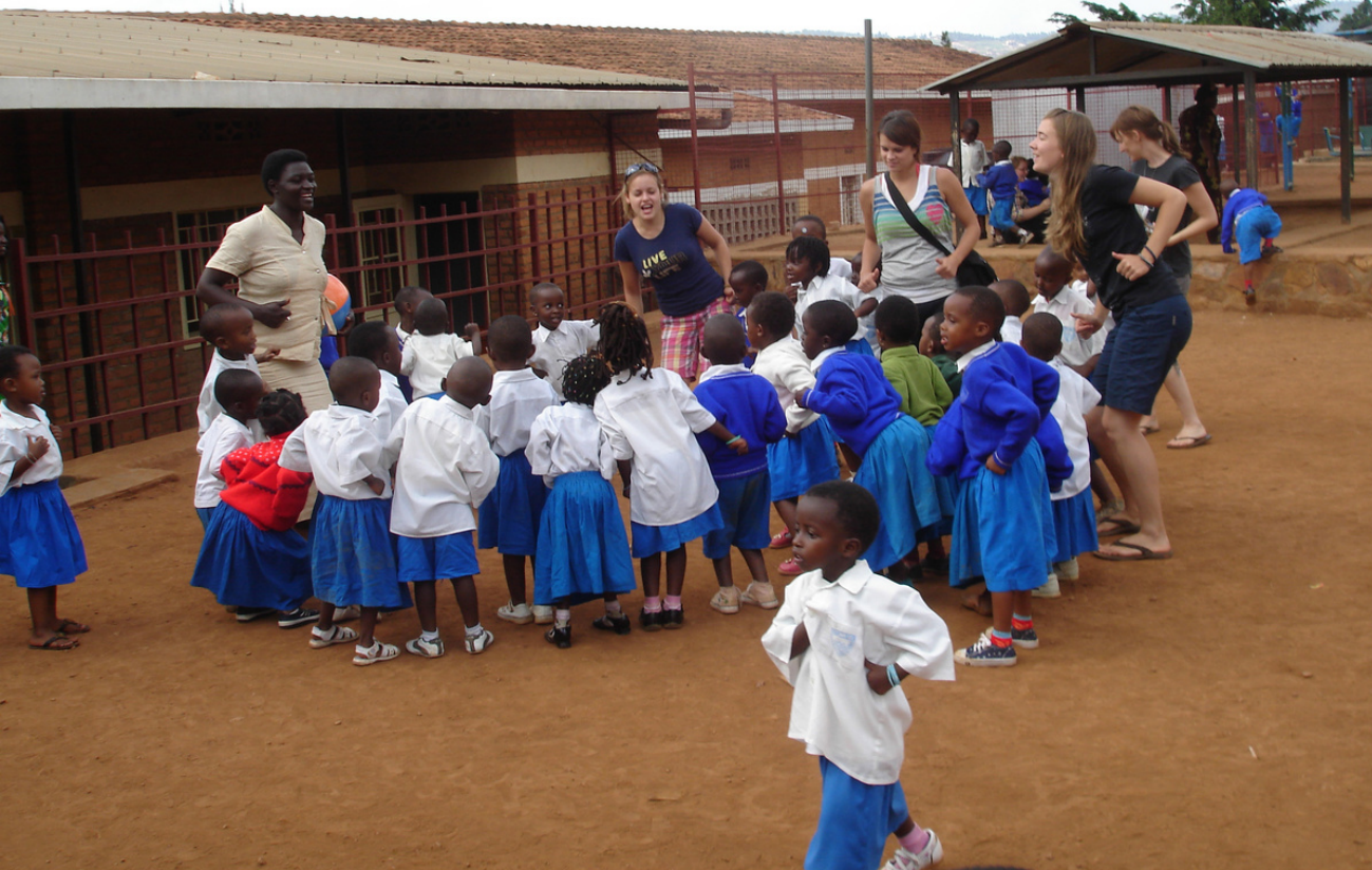
Morning warmup at Gisimba Orphanage.