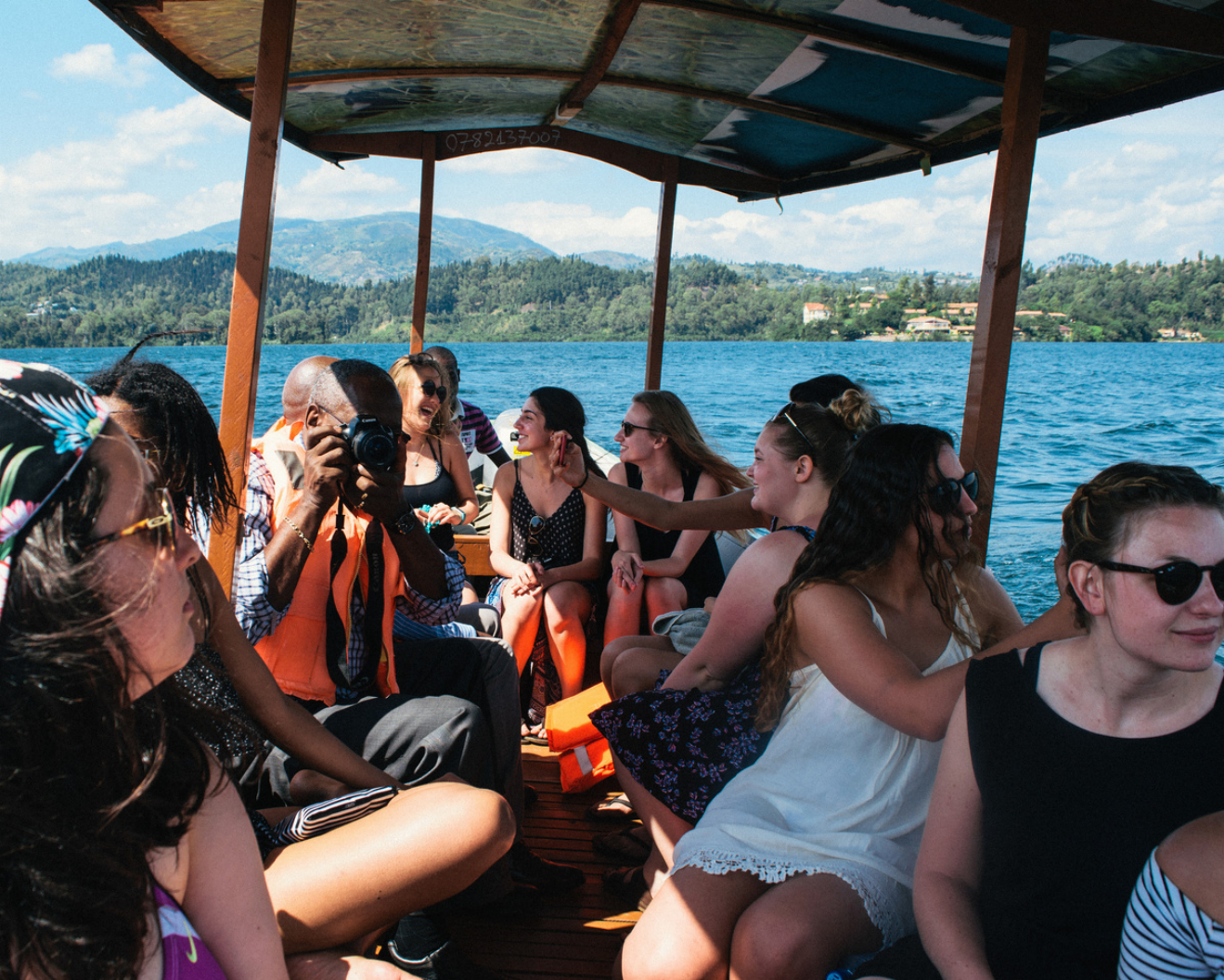
In a boat on Lake Kivu (2016)