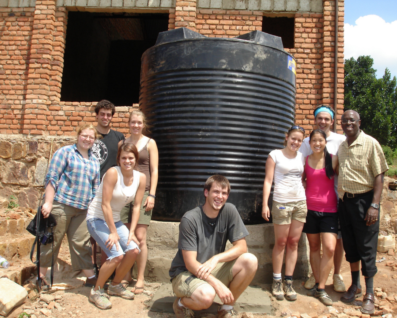
2010 Team at Hope Village Orphanage helping build a water tank.