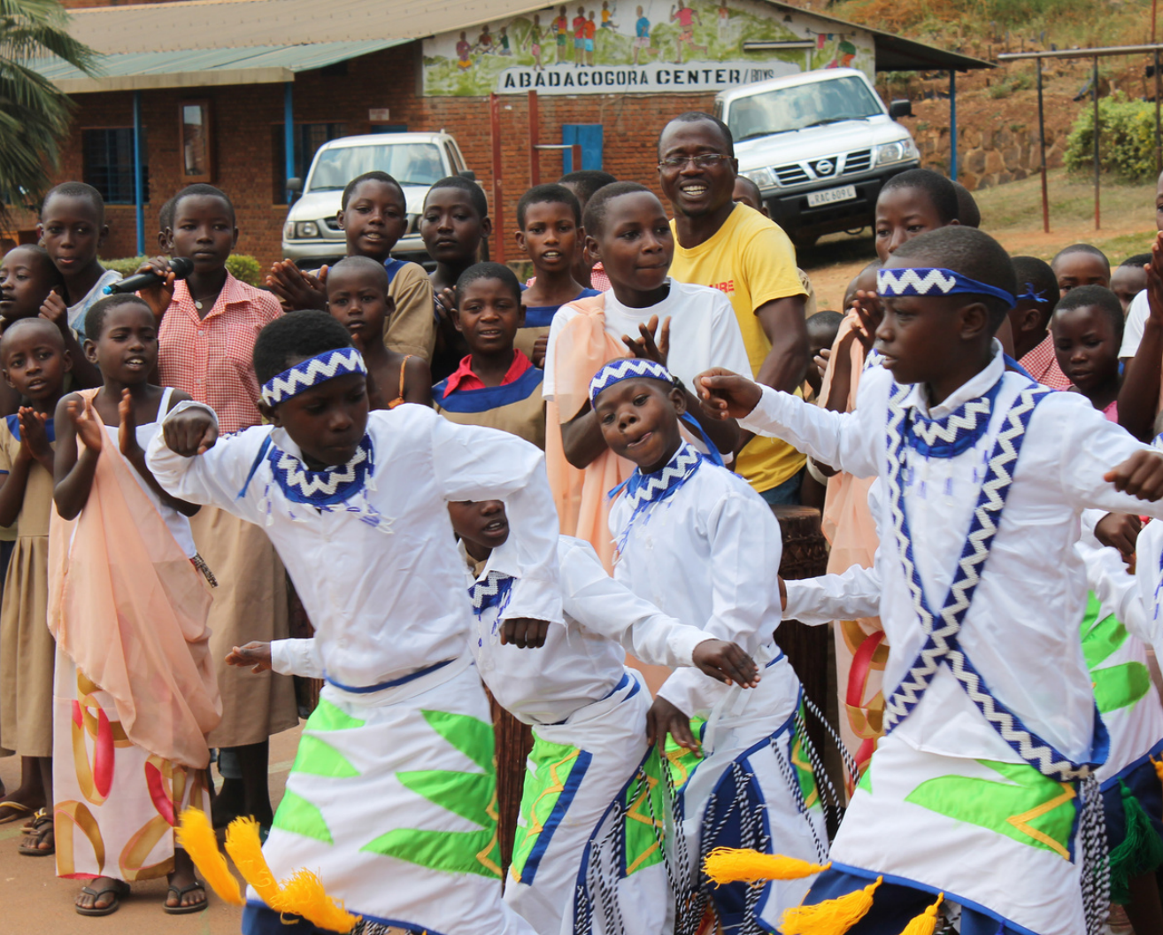
Celebrating the Day of the African Child at Caritas (2016)