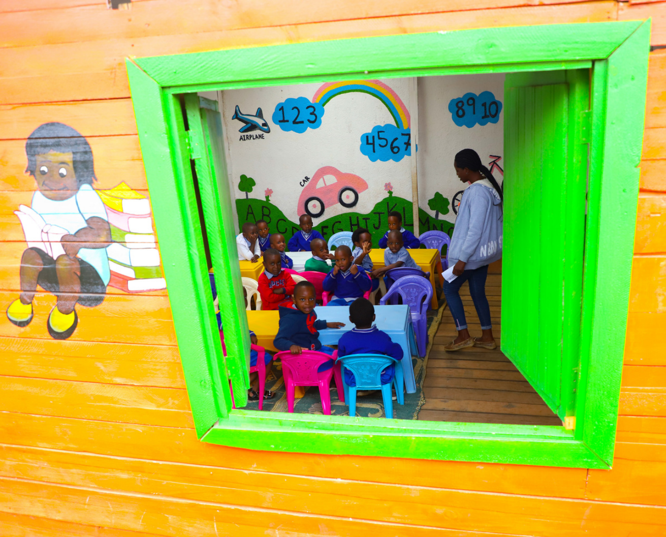
Aspire Rwanda classroom (2019).