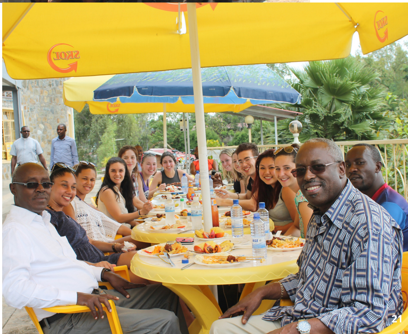
2015 team enjoying lunch.