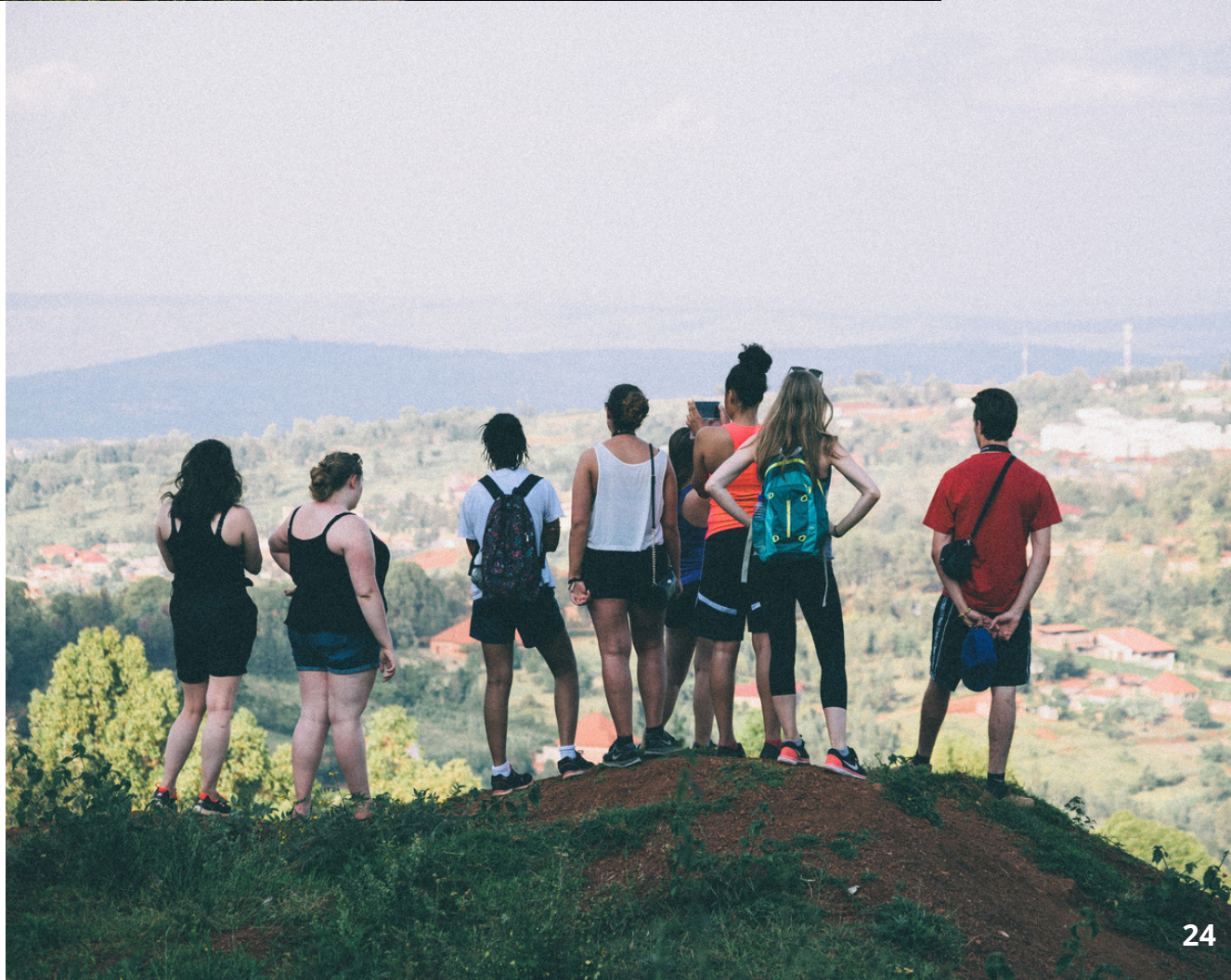
The 2016 Team on a Hike- taken by Sean Cousins (2016)