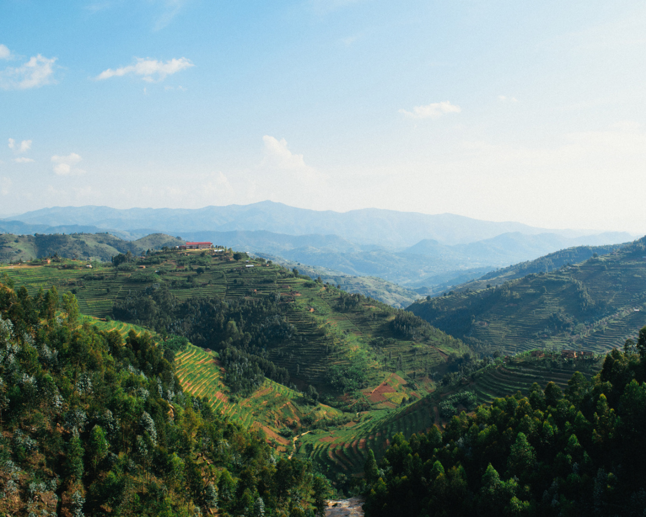
"Land of a Thousand Hills" taken by Sean Cousins (2016)