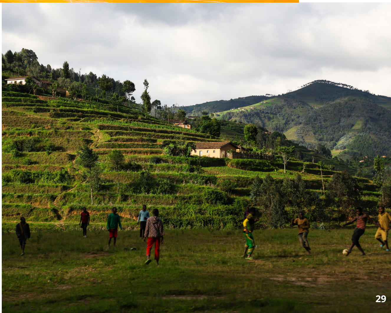
On the road to Kibuye.